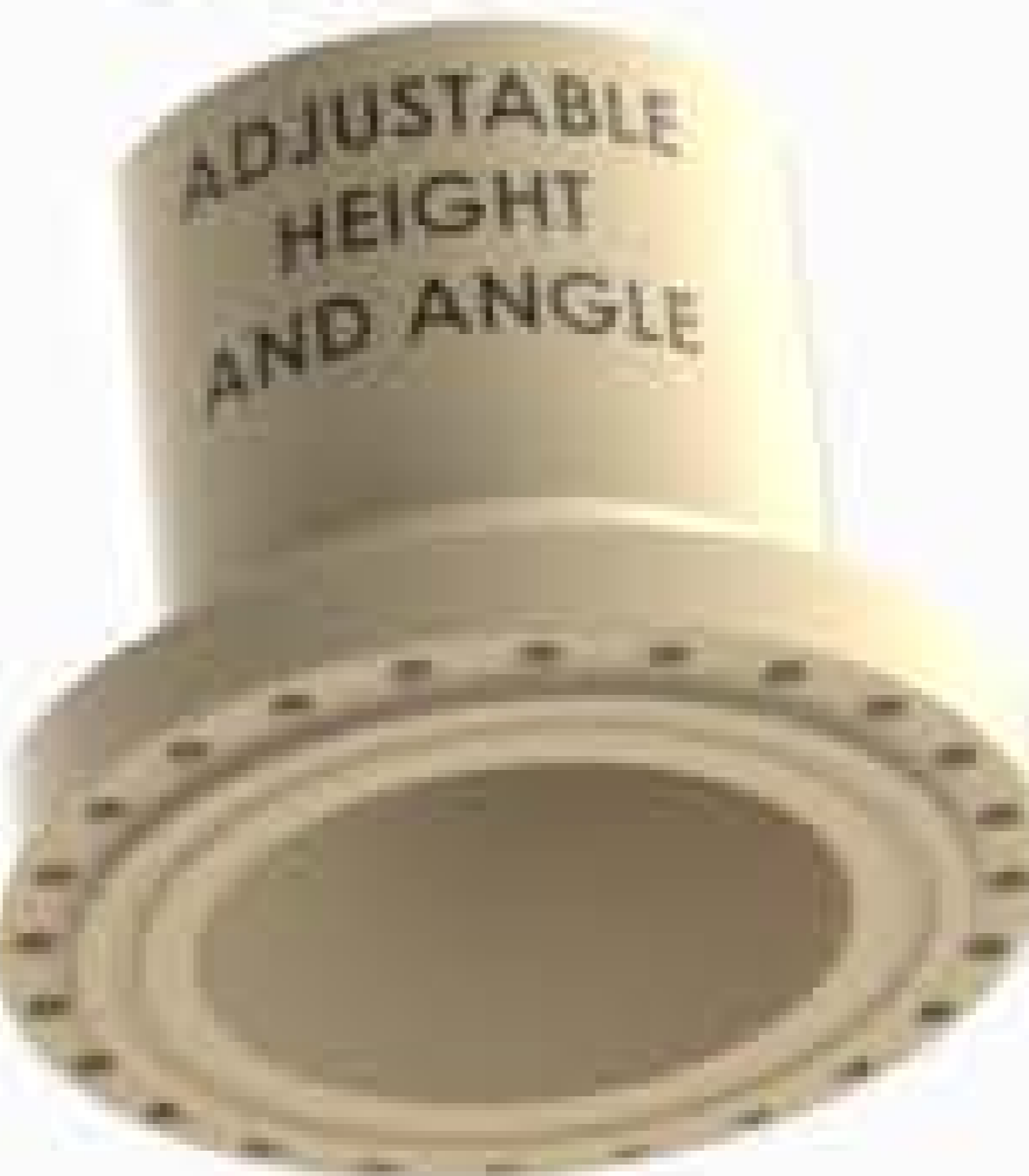
SEALFAST® MULTI-SEAL HOUSINGS