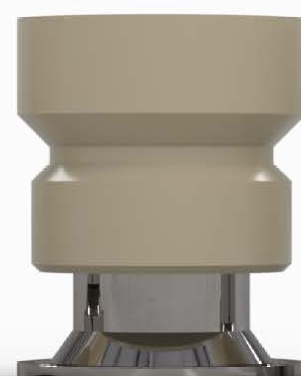
SEALS EVEN WITH MAXIMUM CENTERLINE ECCENTRICITY [UP TO SEVERAL INCHES]