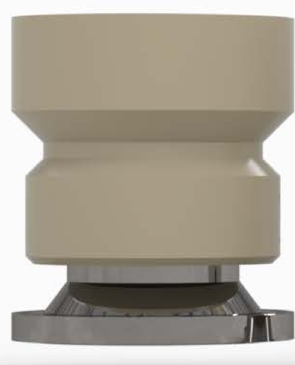
RAPID EXTENSION AND RETRACTION LEAK-TIGHT ADJUSTABILITY

SEALFAST® OIL SEAL HOUSINGS ALLOW MAXIMUM FLEXIBILITY DURING STACK-UP